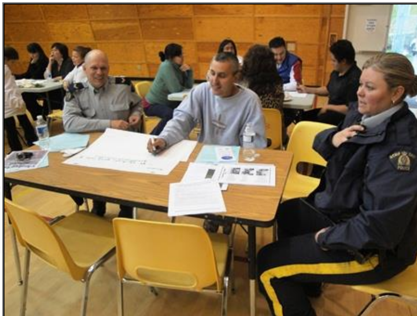
Partners gather together at T'lisalagil'lakw School in Alert Bay for a community forum on Aboriginal Education – April 2010

GOAL 4: All partners will work together to foster success for Aboriginal students through relationship building and partnerships with parents, families and communities.