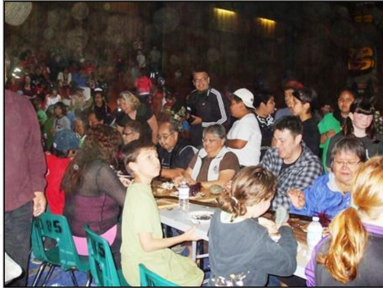
Students from School District No. 85 and Band operated schools enjoy Traditional Foods at the co-hosted Annual Aboriginal Day Event – June 20, 2011

GOAL 1: All Aboriginal students will experience a sense of belonging and respect through the recognition and honouring of their culture, history and values.