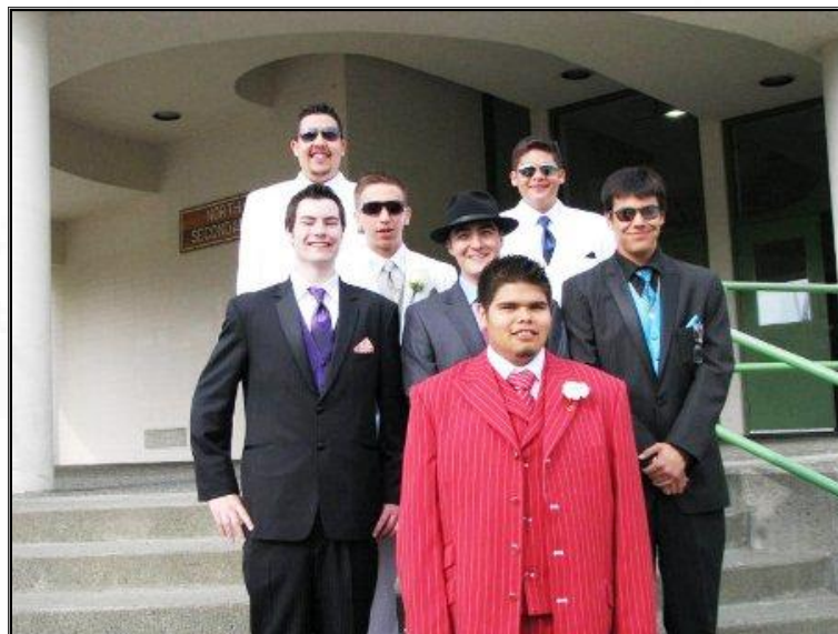
NISS Boys graduate – June 2011

GOAL 2: All partners will work towards increasing the level of academic success for each Aboriginal student.